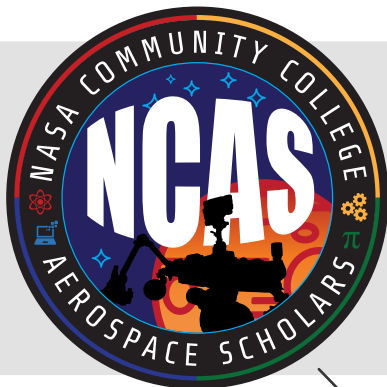
NCAS MISSION PATCH